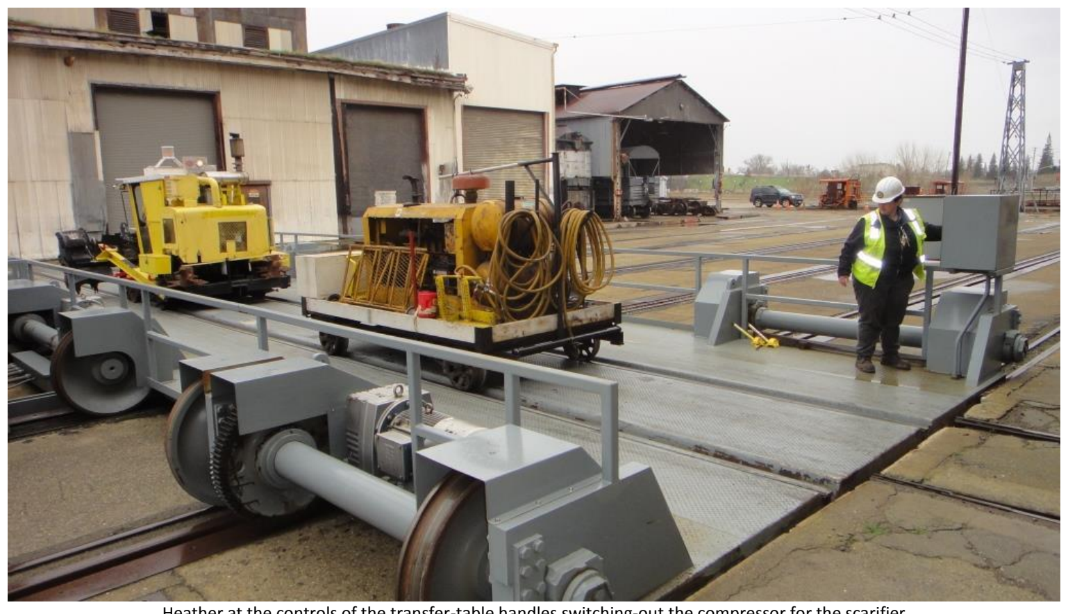
Heather at the controls of the transfer-table handles switching-out the compressor for the scarifier