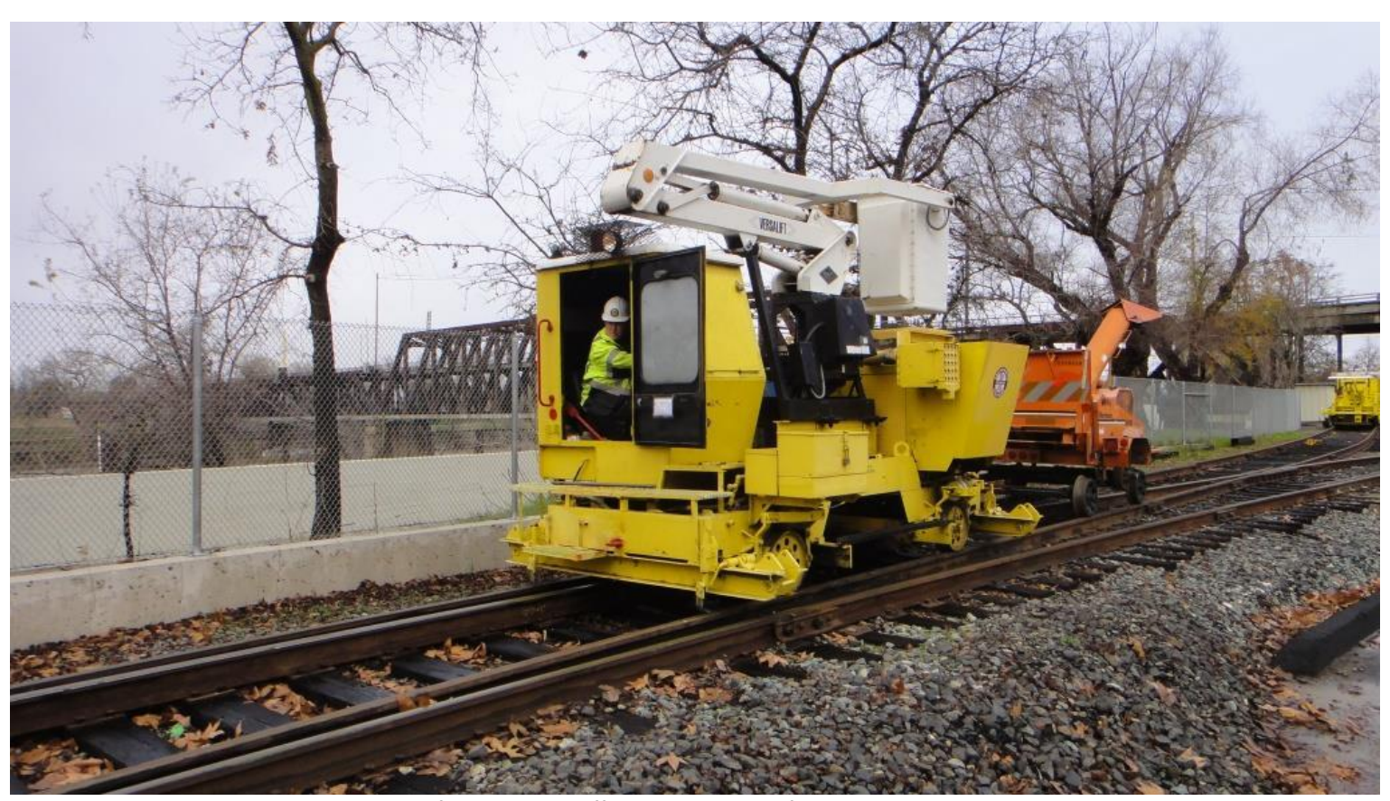
Heather moves the man-lift and chipper off the old 150 Track for placement on the North Turntable Lead