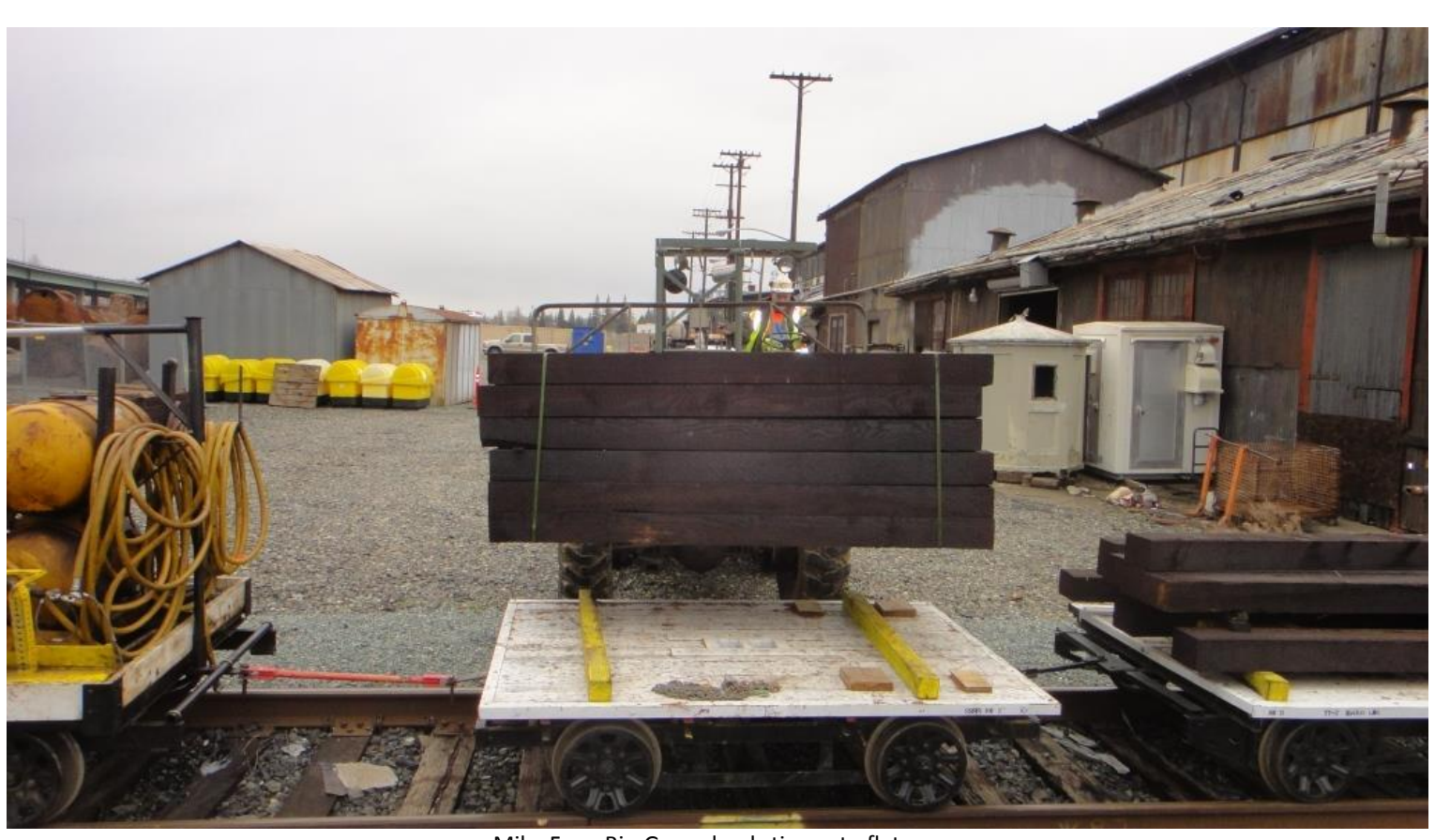
Mike F. on Big-Green loads ties onto flatcars