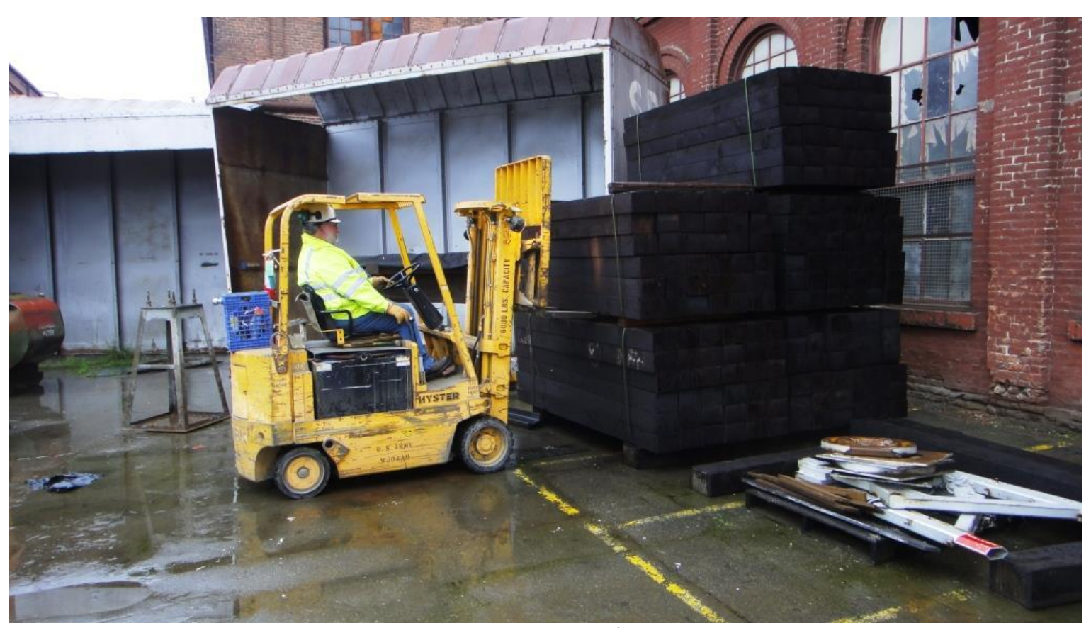
Frank grabs a bundle of ties