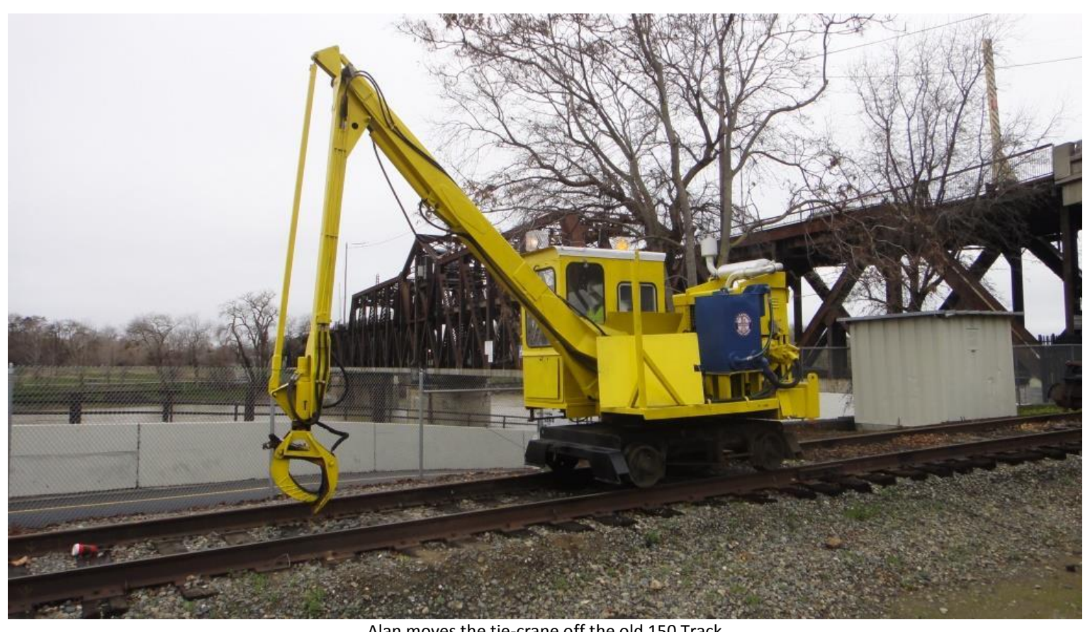
Alan moves the tie-crane off the old 150 Track